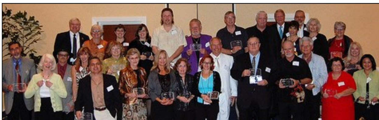
Above: the 2008 RPLA winners.

Gain recognition for your writing, whether it's published or unpublished! Enter the Royal Palm Literary Awards competition. This year's competition will be bigger and better than ever, with more categories, more winners, new judges, and a new (much shorter!) format for the Awards Banquet. For more information, see www.floridawriters.net .